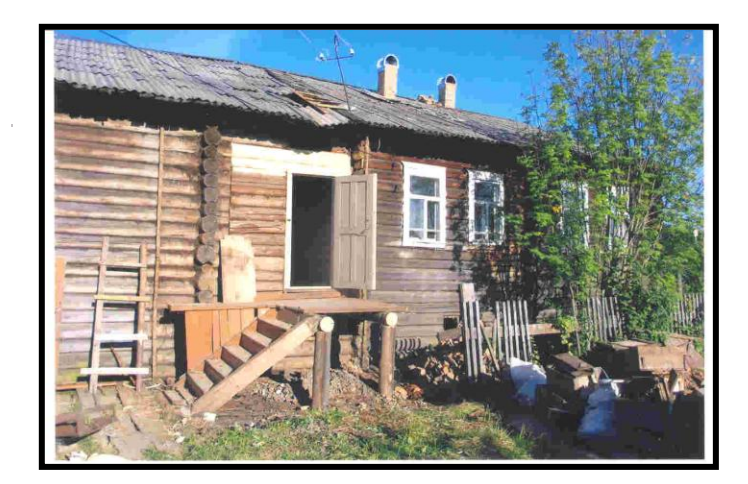
A "before" picture of the outside entrance to the new church. How many differences can you spot?