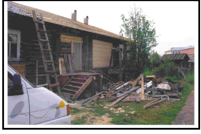
An "after" picture of the outside entrance to the It looks like William is still using the Heart Van.