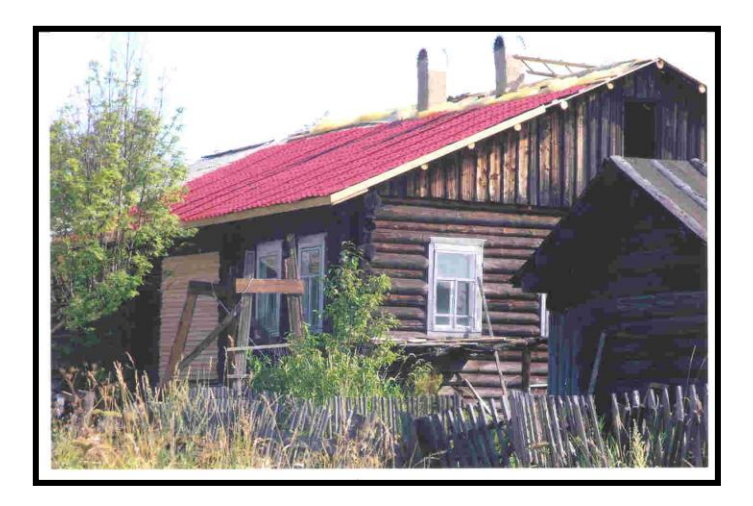
One side of the new roof almost completed.