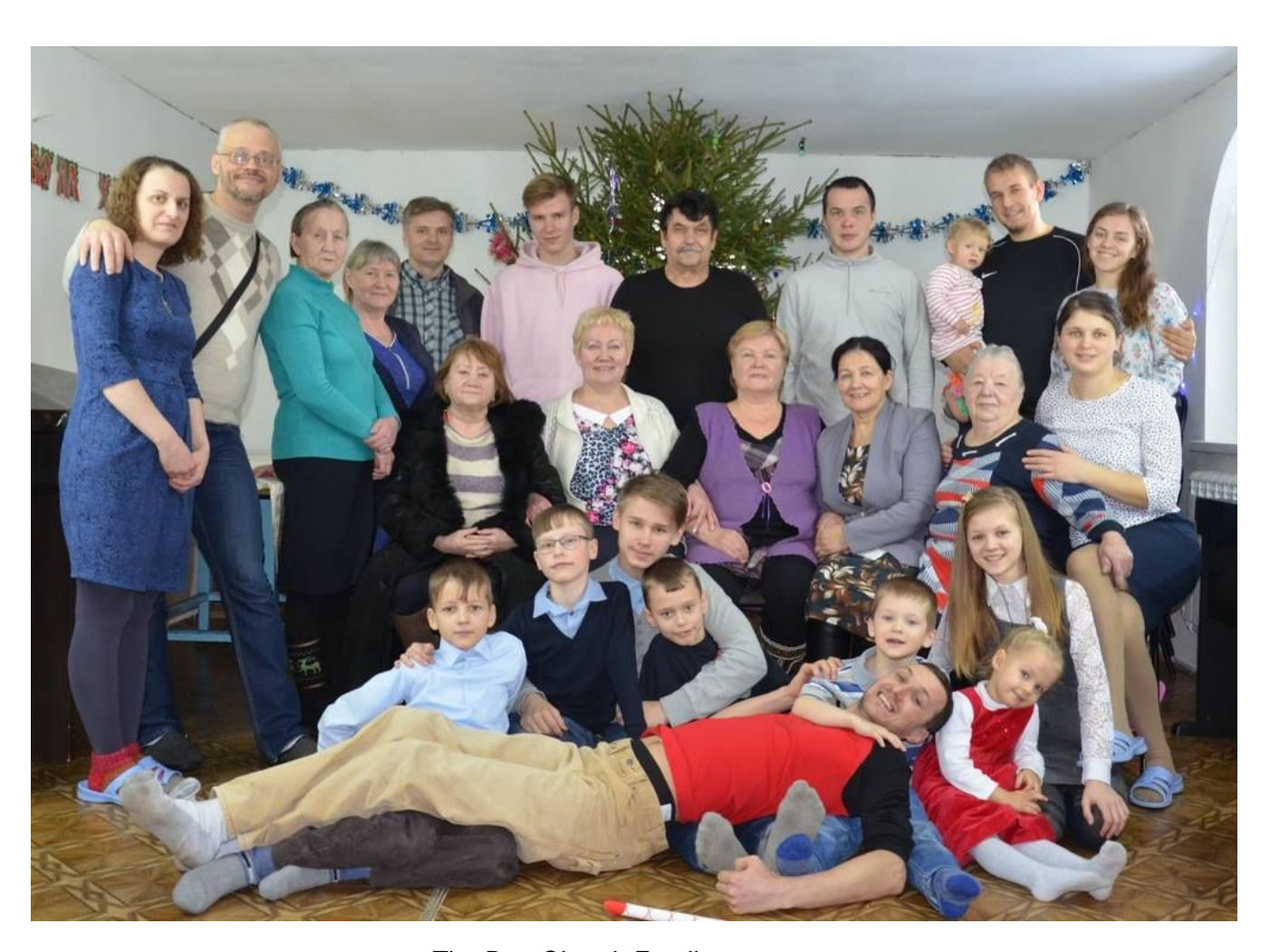
The Don Church Family

The Don church continues being the light in the community. I have been preaching a series of sermons on the spiritual lessons from King David's life, his ups and downs. By learning about David's life, the Don believers have been trying to understand how to be people after God's own heart. We recently took a picture of the Don church house at night. You can see the light shining through the glass cross of the house. It is a good symbol of what what WWMtR has been trying to do all these years - to be the light in the local community. We give all the glory to God!